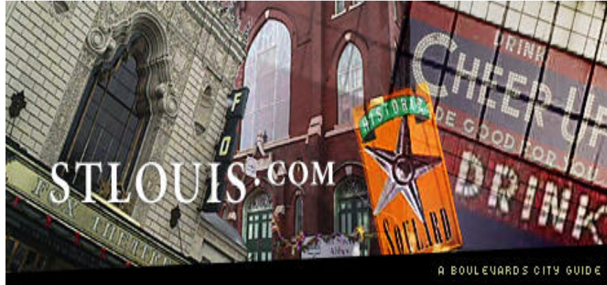
Fig. 7: Header of landmarks, including tile advertisements at www.stlouis.com

the interior and exterior of the building. He most likely added offices to the eastern side of the first floor and manufactured the soda on the second floor. 35 Most of the changes in the first floor architecture that can be seen today were probably made by Cox, especially the addition of a post-19 th century curved brick wall that splits the first floor into two sides. 36 Cox also added an elevator, seen on the 1937 Sanborn Map , to transport equipment and products between the first and the second floor. 37 The St. Louis Building Department recorded the additions of two hot air furnaces and a “brick factory” for $1500 in 1927, and the altering of the three-story “brick factory” for $300 in 1942. Shortly after opening the factory, Cox added color tile advertisements of “Drink Cheer Up, Made Good for You” and “Drink Smile, Refresh with a Smile” on the lower exterior of the northern and eastern facades of the