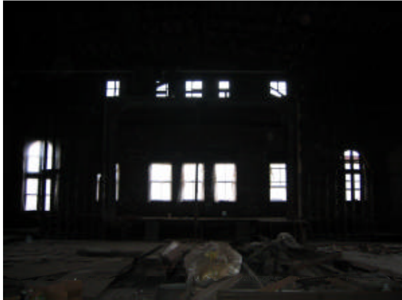
Fig 3: The second floor windows, stage and arch along the eastern wall

tavern. Stairs provided access to the second floor. The large, open second floor with high, tin covered ceilings presented the perfect setting for a gymnastic auditorium. Dressing rooms and a stage surrounded by a tin arch along the eastern wall (see fig. 3) allowed for performances in front of a large audience, which sat in the third floor three-sided mezzanine on the western side of the auditorium. 6 The structure of Union Capitol Hall enabled ethnic groups to congregate indoors and enjoy the entertainment opportunities that the building provided.