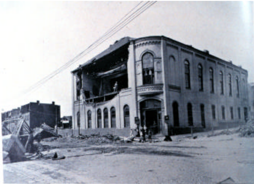
Fig. 4: May 27, 1896 picture after St. Louis Cyclone

lowered from two-thirds of the 1880 Soulard population to less than fifty percent in 1910. 13 In 1871, Saints Peter and Paul Church constructed “Old Hall” for the German community at 816 Allen, less than one block away from Union Capitol Hall, which was constructed in the same year. While the German population used “Old Hall” for 34 years from 1871 – 1905, the Germans used 2001 S. 9 th only for a short time period sometime between 1871 and 1894, at the latest. 14 Perhaps the Germans stopped using 2001 S. Ninth because other institutions such as “Old Hall” offered similar and better opportunities for German social functions. The drastic change in German population between 1880 and 1910 also demonstrates that initially there may have been a demand for two German halls on the same block in the early 1870s, but when the population decreased, the two (or possibly more than two) German social centers in the Menard neighborhood exceeded the needs of the ethnic community. Changes in the ethnic makeup of Soulard probably led to the Germans’ terminating their lease of 2001 S. Ninth, which opened up its doors to the thriving “Bohemian Gymnastic Association, Sokol.”