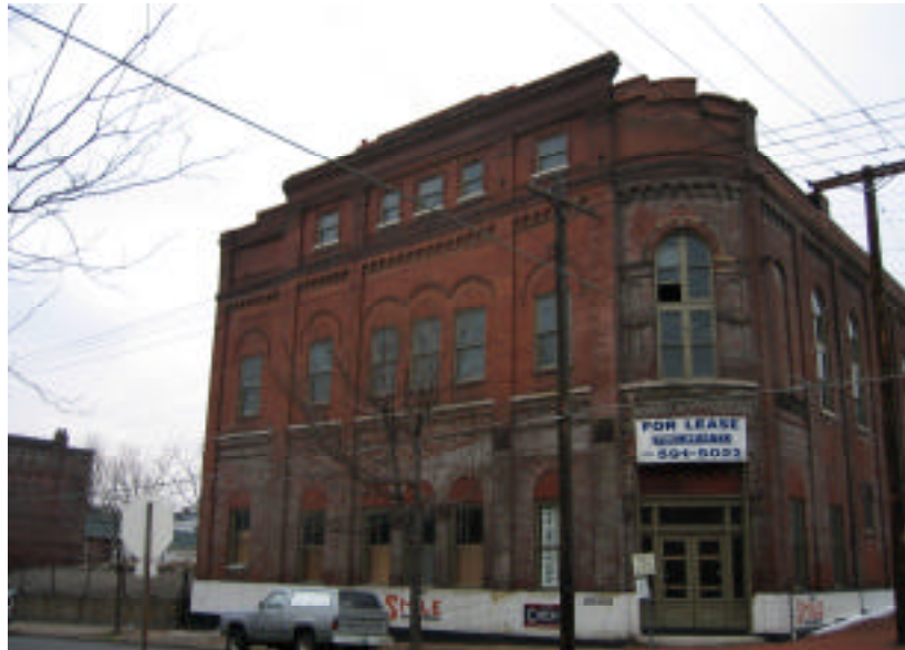
Fig 5: February 2003 View of Eastern Side Reconstructed after 1896

While 2001 S. Ninth played a significant role for the Bohemian community during its peak immigration period, the building shut its doors in 1922 as it became less vital of an institution for a declining Bohemian immigrant population.