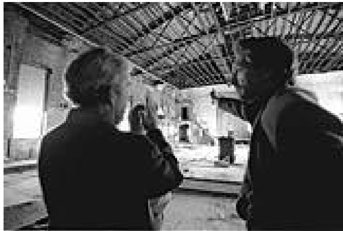
Fig. 9: Rothschild Inspecting Building

Perhaps the building will remain as loft apartments for years to come in the future, expressing what could be a continued period of revitalization and rapid neighborhood growth.