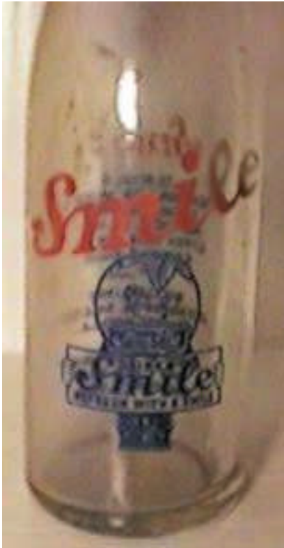
Fig. 6: 10 oz. bottle from Cheer-Up Doughboy Bottlers Inc., Kingsport TN

industry. The factory survived for nearly 35 years as a small soda manufacturer, despite the Great Depression and changes in production that gave more control to large soda plants. 30 In 1937, Missouri was one of the top ten soda producing states, and the 1930 St. Louis Manufacturing Census explains how there were seventeen establishments manufacturing $2,892,097.54 of carbonated beverages during that year. 31 The St. Louis beverage industry included Orange Smile Syrup Company's "Buster Cola," "Cheer-Up Soft Drink" and "Smile Orange Drink." 32 Smile's beverages were part of a national chain that operated at least in St. Louis and Tennessee, as Smile memorabilia was found from "Cheer Up-Doughboy Bottlers Inc."