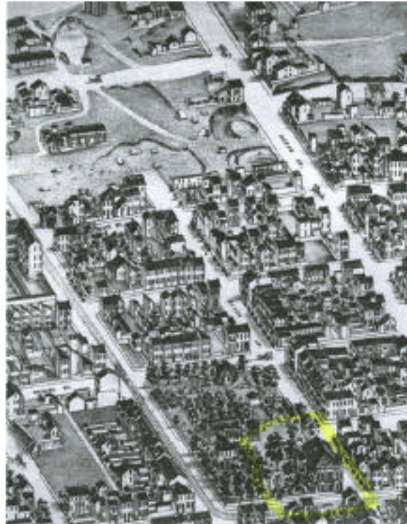
Fig 2: 1875 Compton and Dry Pictorial View of Union Park and Union Capitol Hall

The architectural structure of Union Capitol Hall offered social refuge and indoor entertainment for the immigrant populations of Soulard. In contrast to the open grounds of the rest of Union Park, the immense two story enclosed brick and wood structure spanned 7811 square ft, with dimensions of 120' x 142' 2". The first floor of the building included sections to be used for dining halls, clubrooms and a